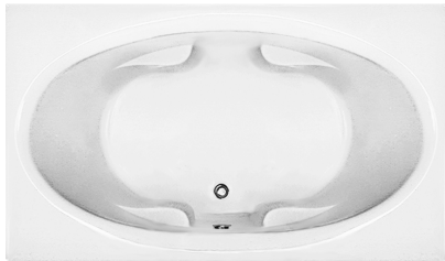
Features integral armrests.